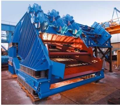
Bild 3: Eines der neuen Siebe kurz vor der Verschiffung Fig. 3: New screen waiting to be shipped