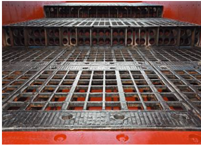
Bild 2: Das zweistufige Siebdeck der neuen Siebgeneration Fig. 2: Two-step screen deck of the latest screen generation